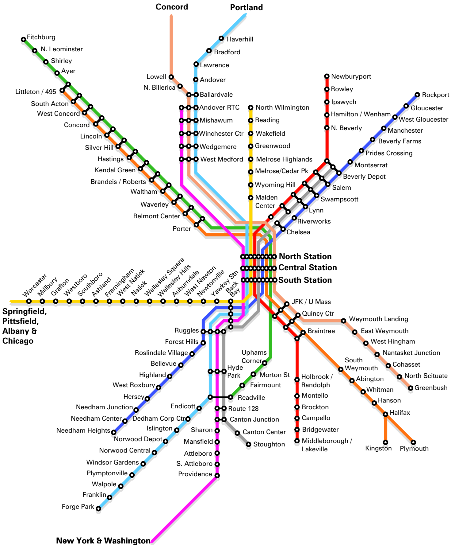
Proposed Commuter Rail System with 9 Line Pairs