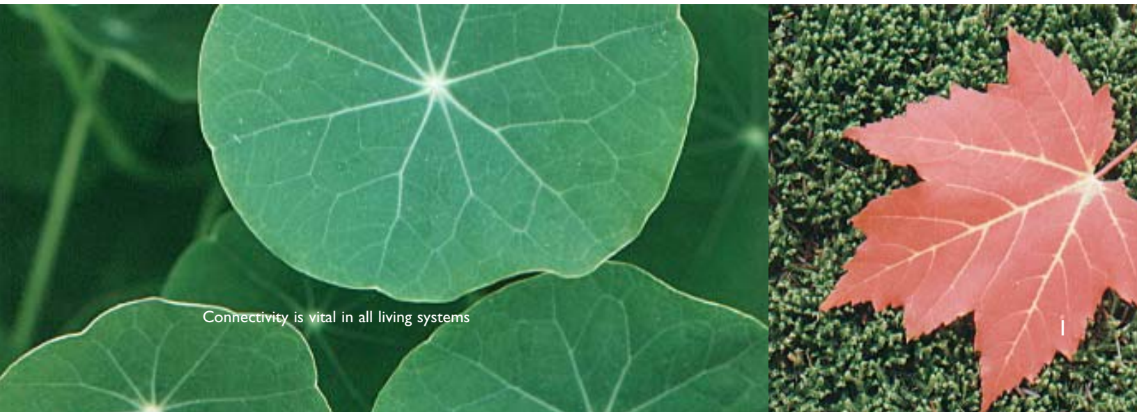
Connectivity is vital in all living systems

The high cost of living in Massachusetts is a competitive disadvantage for the state. Recent U.S. Census data estimates that the state is losing significant population to neighboring states, as well as the Southeast and West. The state faces troubling long-term trends and there is no way for one town or region in the state to grow its own way out of the affordable housing crisis. In fact, the state has many cities and towns with affordable middle-class housing that are eager for new